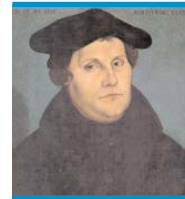
Martin Luther Father of the Protestant Reformation 11/10/1483 - 2/18/1546

One of the key slogans of the Reformation is Soli Deo Gloria - to God alone be the glory! I want to suggest that slogan captures for us the road to recovery. It begins by