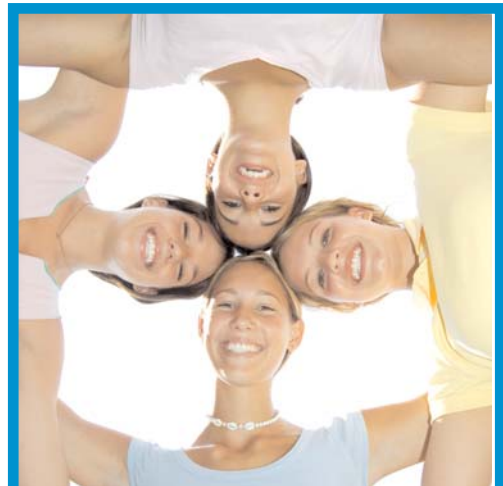
Gearing up for a summer full of Godly fun!

Jr./Sr Water Country, August 16 th - It's wet, it's wild, and it's a Christ Chapel youth group favorite.